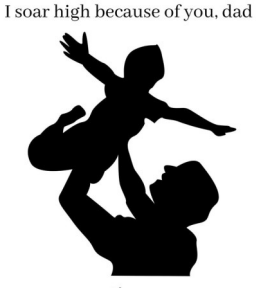
Happy Father's day

For all fathers, godfathers, grandfathers, uncles, brothers, cousins and special friends who touched your heart all year. Please fill out the form for both living or deceased and put in collections or drop off at the office or even email me at parish@mhctampa.org. by June 13th.